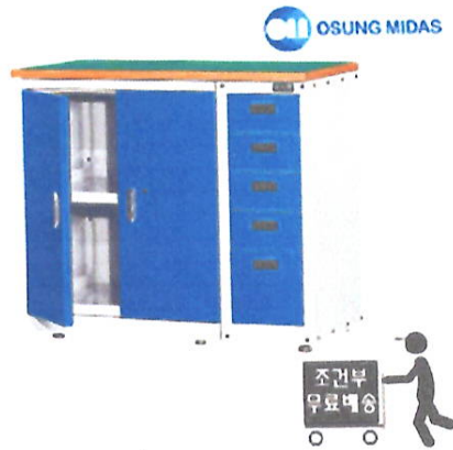
Preferred cabinet for SLA Printer