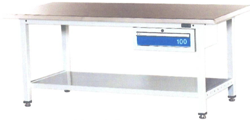
Preferred worktable for: