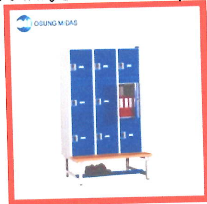
Preferred cabinet for DMLS