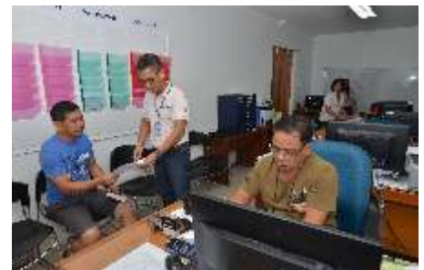
A client discusses the scope of work with a TSS staff.