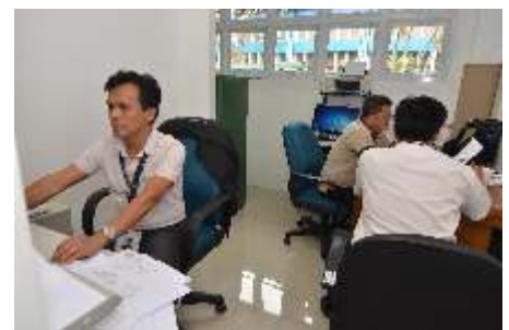
TSS staff busy at work.