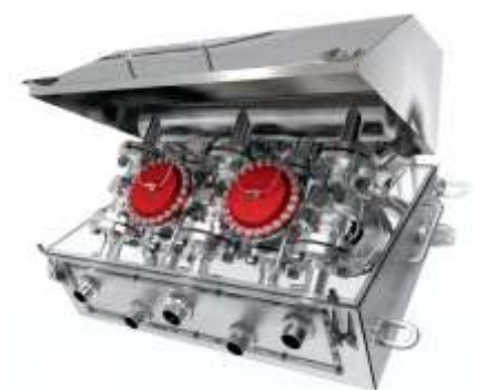
Pneumatically operated water control valves