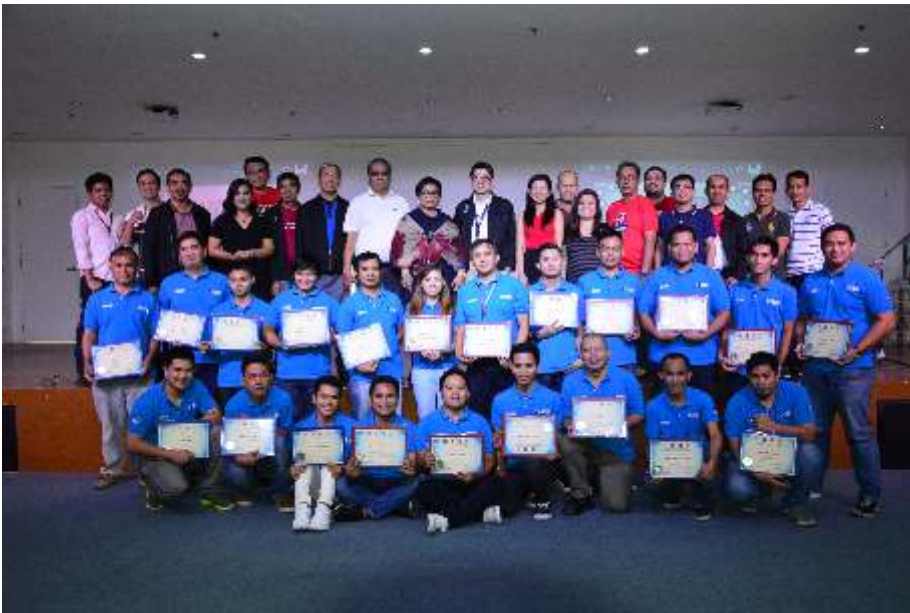
Gear Making and Basic Gear Design Training Graduates pose with their instructors, some key officials and facilitators.

A special occasion took place as the MIRDC held the Closing Ceremony of the Gearmaking and Basic Gear Design Training on December 15, 2017, 9:30 a.m. at MIRDC Titanium Auditorium, MWS II Bldg., General Santos Avenue, Bicutan, Taguig City. A total of 21 participants consisting of technical personnel from metalworking companies and academe graduated from the training program.