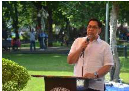
GenSan City Mayor Ronnel C. Rivera (L) and DOST Secretary Fortunato T. De La Pe a acknowledge the important roles and their respective commitments in the successful adoption of the HERT by GenSan City.

The messages were immediately followed by the ribbon-cutting ceremonies and the demo run of the HERT. This event marked an optimistic beginning of the transformation and modernization of the transport system in the city of General Santos.