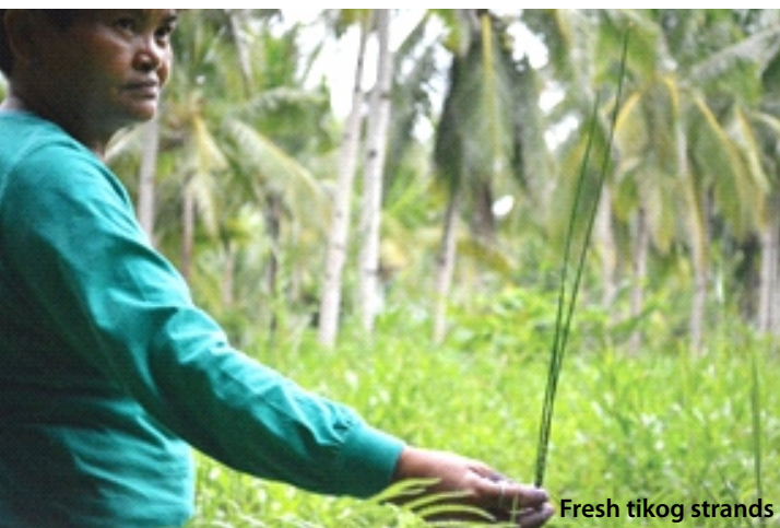
Fresh tikog strands

The improved Tikog Flattening Machine is lighter and more compact than its original counterpart. Aside from being more portable and less demanding of working space, the improved Tikog Flattening Machine will increase the weavers' productivity and enhance the quality of tikog-based products.